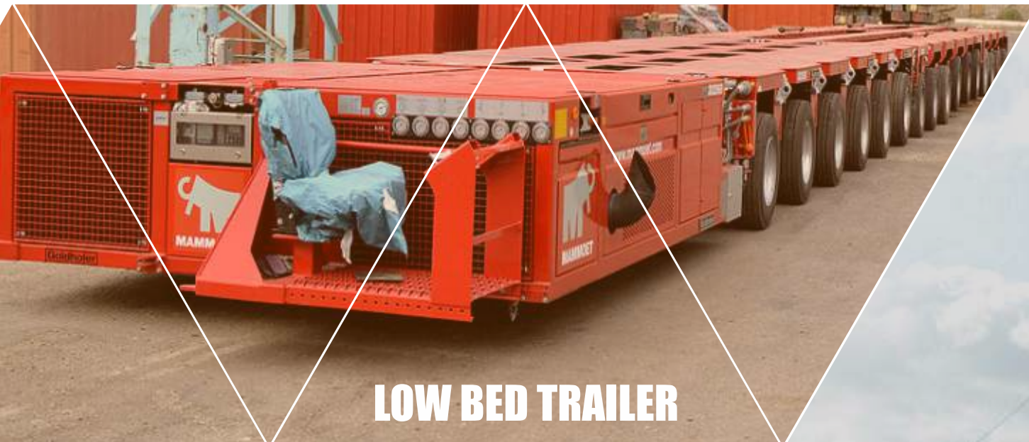
LOW BED TRAILER